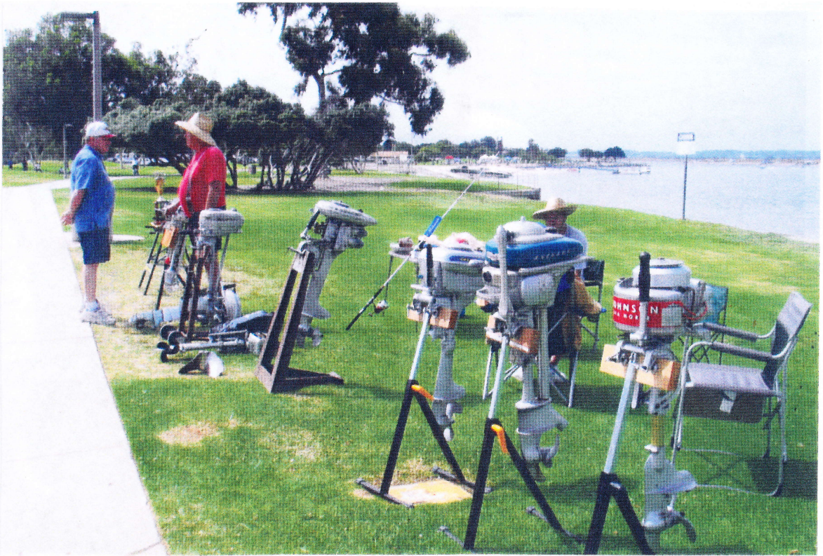
The weather was great at the Mission Bay meet in August and a number of visitors stopped and inquired about our antique outboard display.