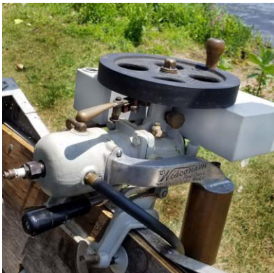
Constantine's Theme was Row Boat Motors