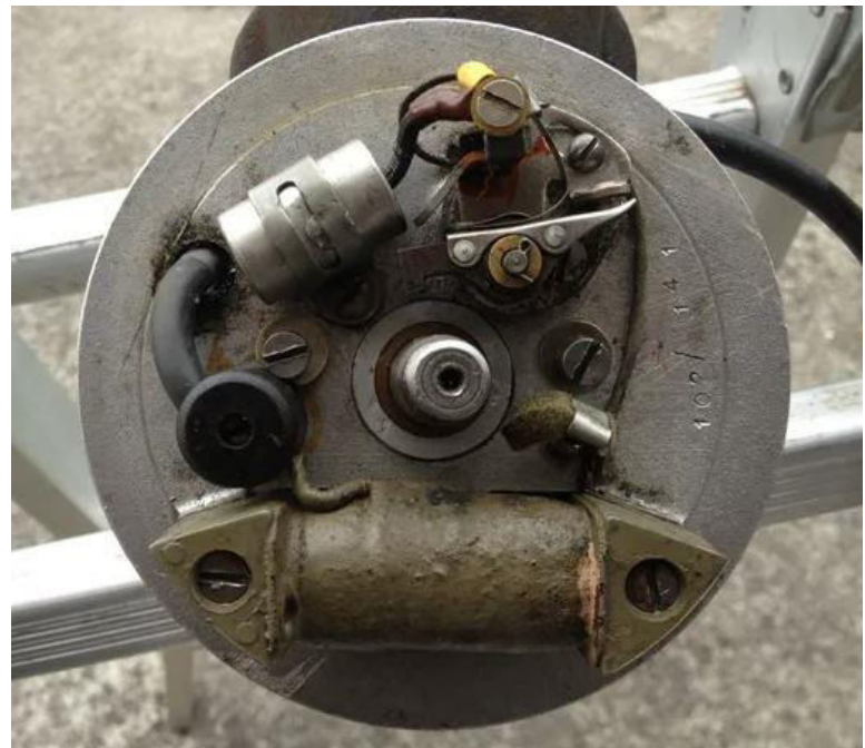
Miller FWH Mag Plate