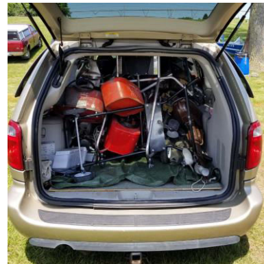
Just how much can a Dodge Caravan hold?

In August....on to the " Tomahawk "Super Meet" " held at Tomahawk, Wisconsin.....the site is Sara Park on an abandoned airstrip (The STRIP; bottom right) on the banks of the Wisconsin River. Many "On the Water" events including a great boat cruise in the evening.....and an "Ice Cream Run" using RBM,s.