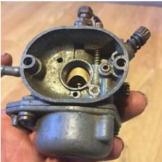
Zenith Model 13MXZ