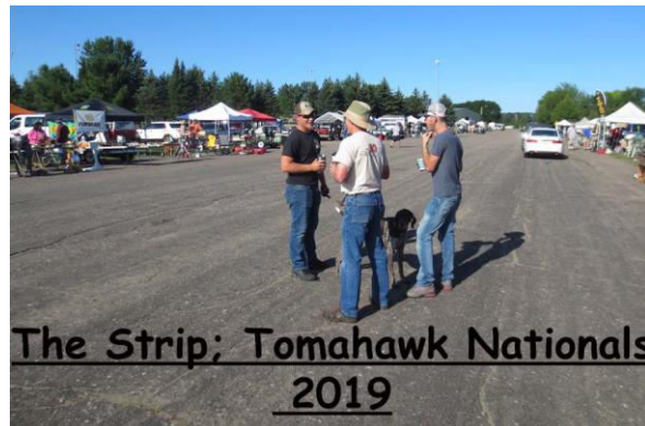
The Strip; Tomahawk Nationals 2019