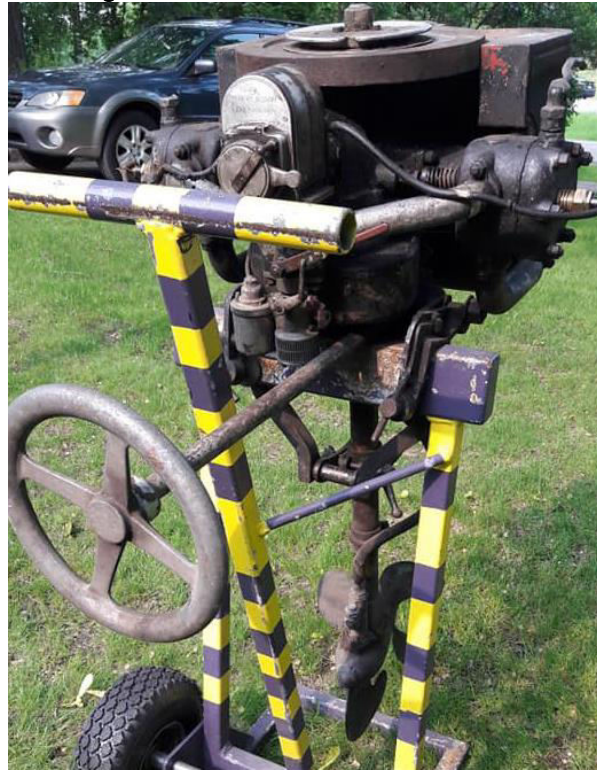
Some Hints Below